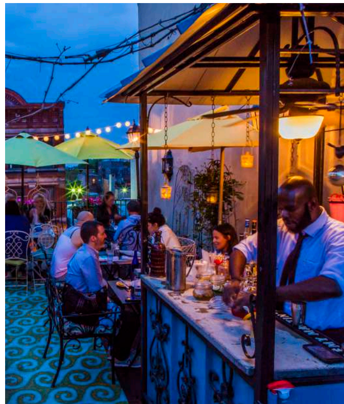
Skinner's Loft, rooftop dining, Jersey City

For a full listing of restaurants, scan here or go to Visithudson.org/restaurants