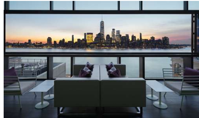
View from Hyatt House, Jersey City

But Hudson County's hotels go beyond views. Arts lovers are raving about the new Canopy Hotel by Hilton in Jersey City's Arts District. And Secaucus' many hotels, from the Courtyard by Marriott to Embassy Suites by Hilton, are perhaps the best places to stay when visiting the new American Dream, or catching a game at Meadowlands. When it comes to Hudson County accommodations, there's a hotel here for everyone!