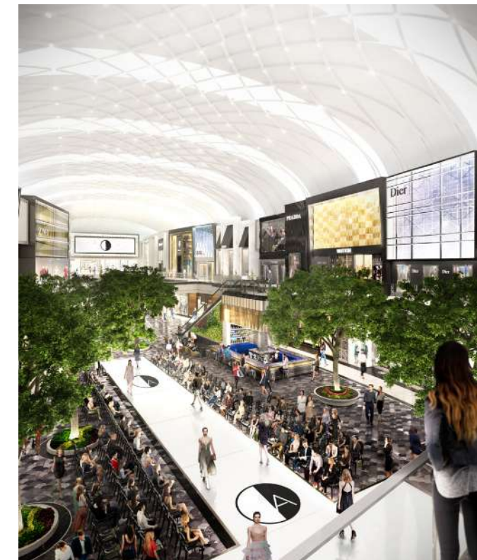
American Dream at the Meadowlands