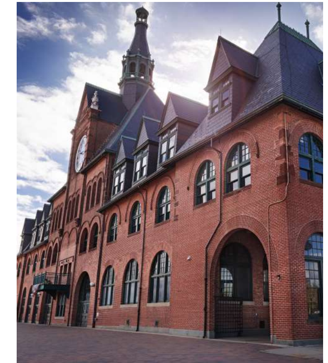
Central Railroad of New Jersey Terminal, Liberty State Park

Discover more Hudson County history at Visithudson.org/history