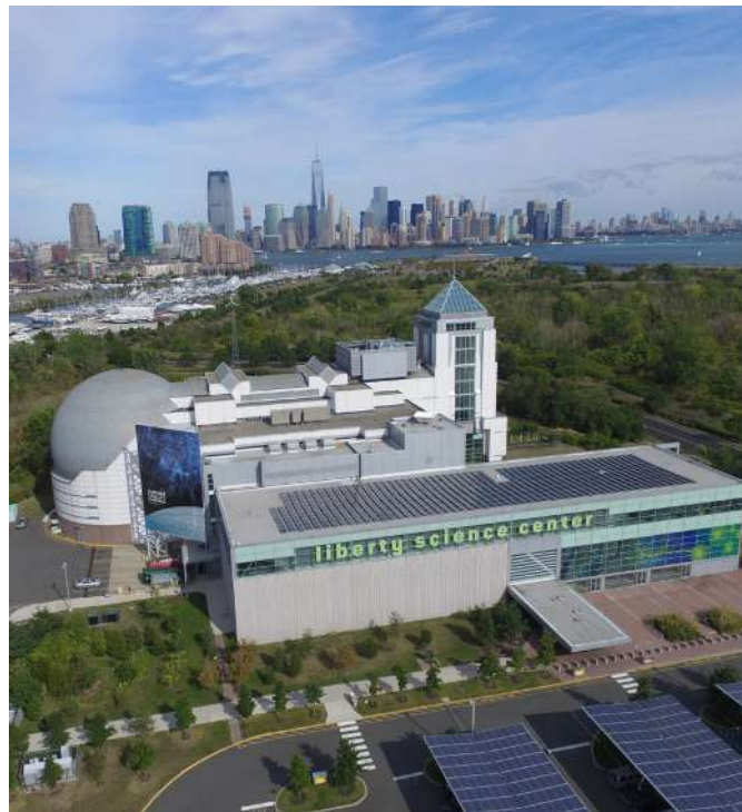
Liberty Science Center in Liberty State Park

Scan here for more information on getting around Hudson County, or go to Visithudson.org/transportationmap