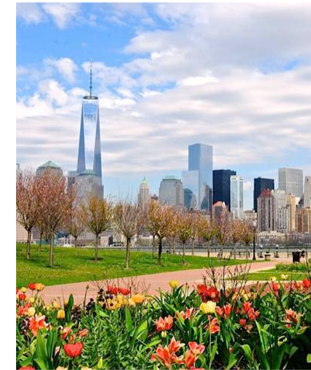
Liberty State Park, Jersey City