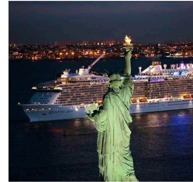
Royal Caribbean Cruise out of Bayonne

For cruise information, go to Visithudson.org/cruises