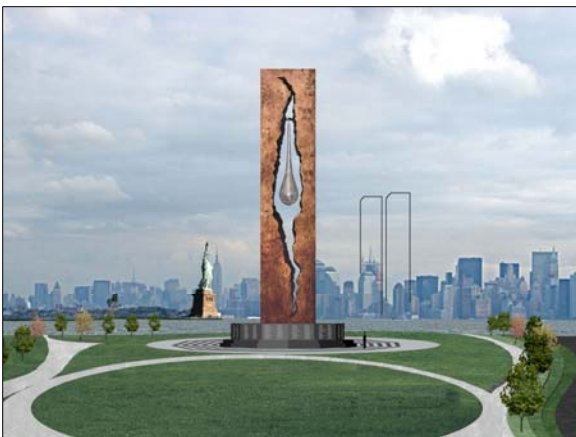
Harbor View Park, Bayonne.

Hudson County is seeking to construct an esplanade at the Weehawken Cove. The project will connect existing sections of Hoboken walkway with future sections in Weehawken.