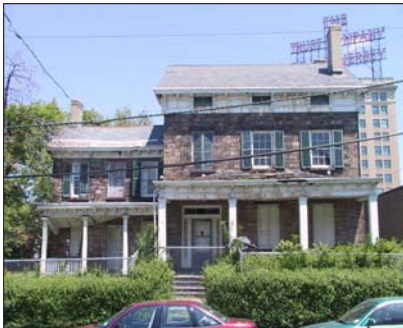
Apple Tree House, Jersey City

The Board of Chosen Freeholders, by resolution dated December 23, 2003, voted to establish the Hudson County Open Space, Recreation & Historic Trust Fund. The Trust Fund, funded through a property tax, dedicated to acquire land for conservation, open space purposes, recreation facility enhancements, and historic preservation.