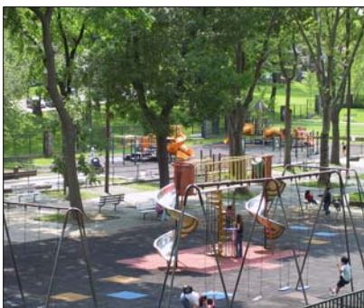
North Hudson Park, North Bergen

Entrusted by the Board of Chosen Freeholders, the Hudson County Open Space Trust Fund Advisory Board, has the duty to review, prioritize and recommend projects for open space, recreation and historic preservation funding that meet the goals and objectives outlined in the Hudson County Open Space & Recreation Plan.