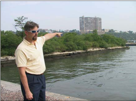
Hudson River Waterfront Walkway, Weehawken Cove

The City of Bayonne has worked with the NJ Dept. of Transportation and NJ Dept. of Environmental Protection to lease property along the Newark Bay for a passive waterfront park. The park's design includes an environmental/educational walkway for bird watching and wetlands appreciation, as well as an amphitheatre.