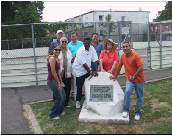
Advisory Board members at Bell Playground, Kearny

The Educational Arts Team, Inc., a nonprofit organization, applied for funds to repair the facility's pool. Camp Liberty provides summer camp programs to youth from Jersey City, Bayonne and other parts of Hudson County.