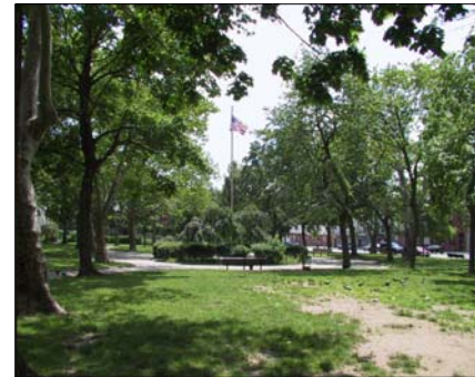
Fisk Riverview Park, Jersey City

The Board of Chosen Freeholders, by resolution dated December 23, 2003, voted to establish the Hudson County Open Space, Recreation & Historic Trust Fund. The Trust Fund, funded through a property tax, dedicated to acquire land for conservation, open space purposes, recreation facility enhancements, and historic preservation.