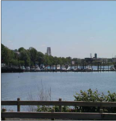
Bayonne Park and Marina

On June 26, 2003, the Hudson County Executive requested, and the Hudson County Board of Chosen Freeholders approved a resolution authorizing the placement of a public question (referendum) on the general election ballot for the establishment of a County Open Space Recreation & Historic Preservation Trust Fund. On November 4, 2003, the ballot question was approved by a two-to-one majority of County voters.