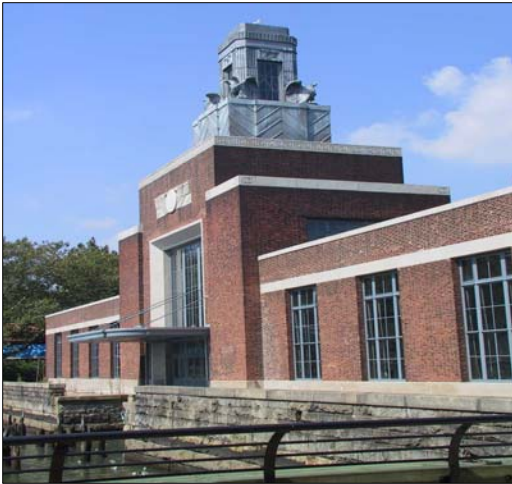
Ferry Terminal, Ellis Island

The Friends of Loew's Theatre are seeking funds for the interior restoration of the theatre. Included in their request, is funding for the stage repairs and upgrades, air circulation and conditioning, fire escapes, entrance façade repair, and marquee roof. The repairs are intended to expand the usability of theatre.