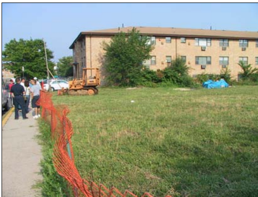
North Street Youth Soccer Field, Bayonne

After much success with the public garden located at 3800 Park Ave. The Township of Weehawken plans to acquire vacant land located at 2800 Palisades Avenue for a public garden. The public garden will provide passive and recreational opportunities for the surrounding neighborhood and adjacent elementary school.