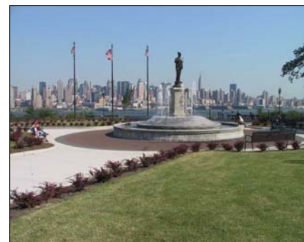
Donnelly Park, West New York

Entrusted by the Board of Chosen Freeholders, the Hudson County Open Space Trust Fund Advisory Board, has the duty to review, prioritize and recommend projects for open space, recreation and historic preservation funding that meet the goals and objectives outlined in the Hudson County Open Space & Recreation Plan.