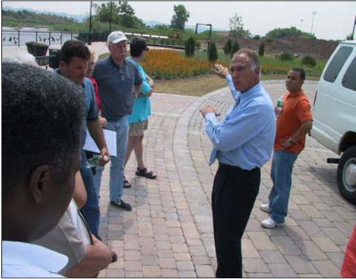
Mill Creek overlooking the "Petrillo Site", Secaucus