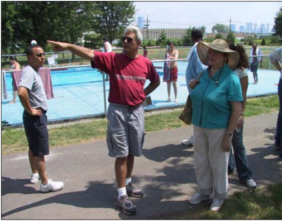
Camp Liberty Pool, Jersey City