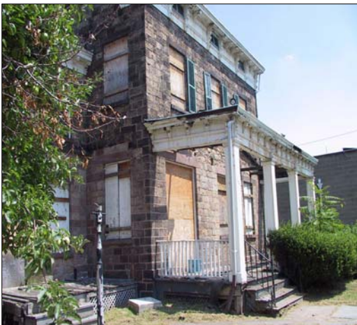
Apple Tree House, Jersey City

The nonprofit group, Save Ellis Island, Inc. submitted an application for the restoration of the interior of the Ferry Terminal. The Ferry Terminal is a fine example of Art Deco design and will serve as a grand entrance for tourists and educational historical tours of other Ellis Island buildings.