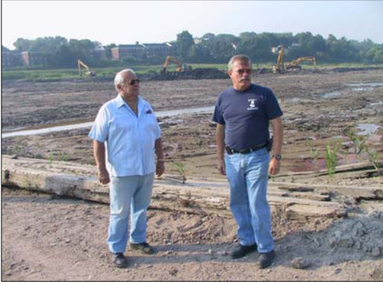
North 40 Park, Bayonne