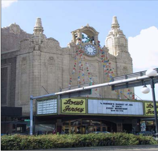
Loew's Theatre, Jersey City