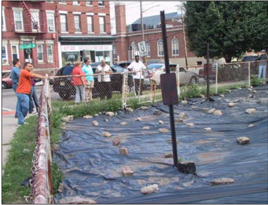
Maple Street, Weehawken