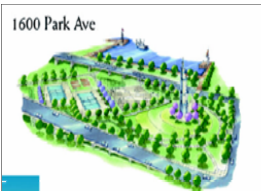
Excerpt from Hoboken's New Open Space Initiatives Plan

The Town of Guttenberg plans to acquire land at 7100 River Road to create a passive waterfront park. The Town won a court case allowing the right to purchase the property, but must close before March 16, 2006.