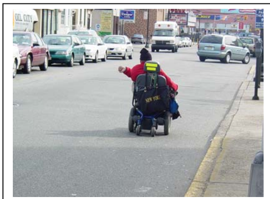
View eastbound along 32 nd Street