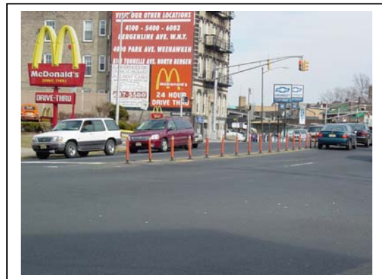
View northbound along JFK from 32 nd Street