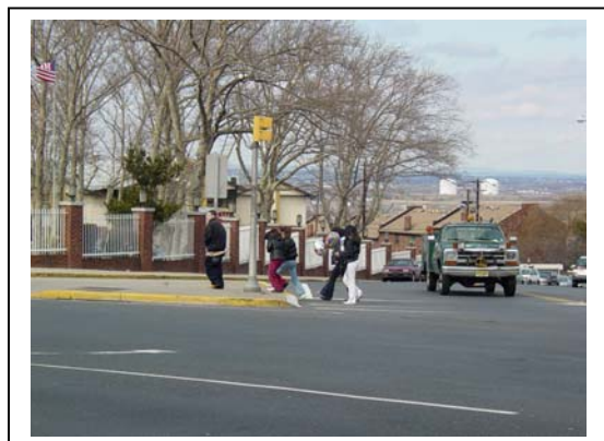
View westbound along 32 nd Street across JFK