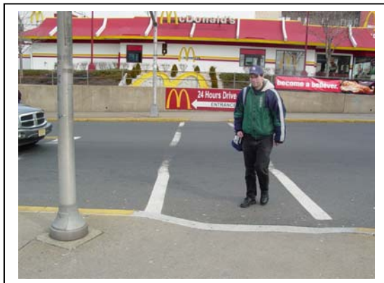
View northbound across 32 nd Street on west side of JFK